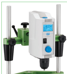
6A. Overhead Stirrer, Digital 115v

Approx. Stand Dimensions: 15.25 W x 17.25 D x 40”H