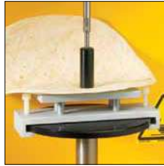
TA-JPA F M Junior Punch Fixture is for punching through flat samples; 12.7mm max. diameter probe. Hole in fixture is 14mm. Rotary Base Table required.