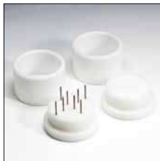
TA-FMBRA F Standard dough pot set for preparing dough samples and measuring dough firmness.