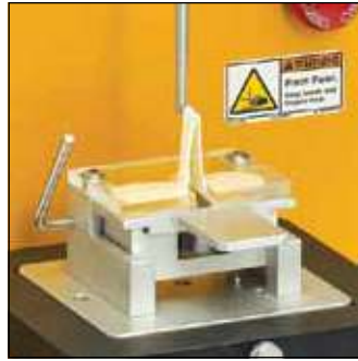
TA-KF F Kieffer Dough and Gluten Extensibility Fixture quantifies maximum force and distance needed to break sample. Fixture Base Table required.