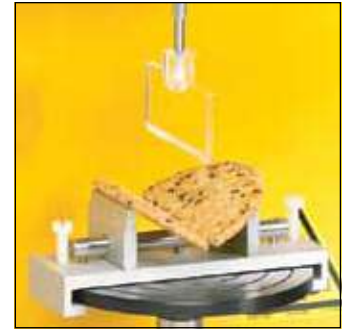
TA-JTPB F Small scale version of Three Point Bend Fixture is used with TA7 blade from general probe kit. Rotary Base Table required.