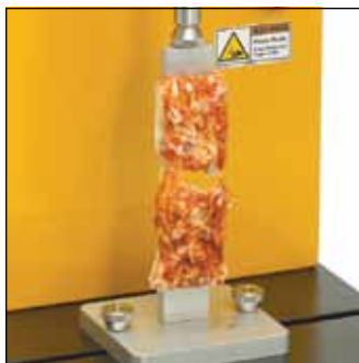
TA-PTF F M Pizza Tensile Fixture quantifies cooked pizza firmness by measuring the tensile force and deformation distance to break sample.