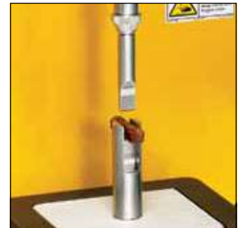
TA-VBJ F Volodkevich Bite Jaws for testing bite force of meat products using shear cutting-test. Fixture Base Table required.