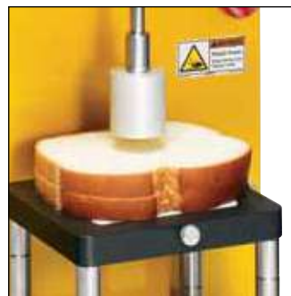
TA-AACC36 F AACC spec probe for measuring bread firmness and performing texture profile analysis (TPA). Fixture Base Table required.