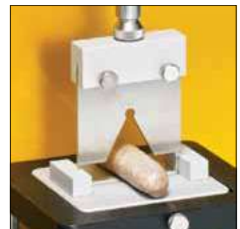
TA-SBA F Shear Blade for products where a cutting-shear test is meaningful: meat, fish, sausage, etc. Fixture Base Table required.