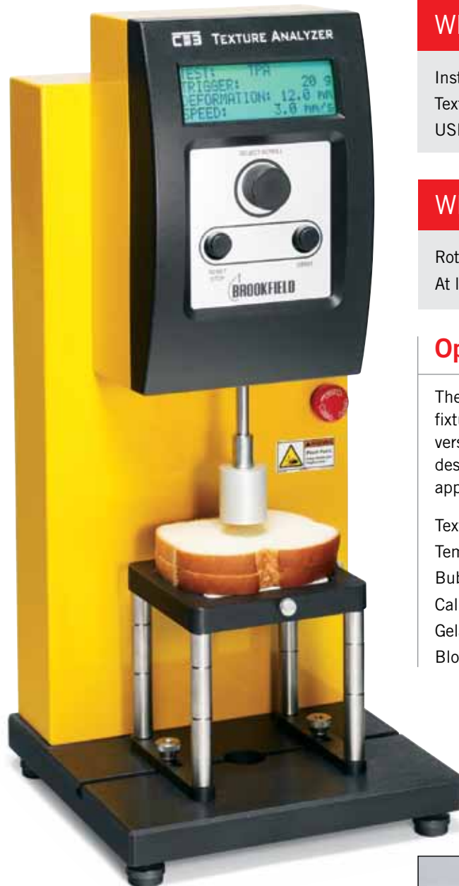
CT3 with Fixture Base Table and Cylindrical Probe in compression mode

allows for larger samples and more accessory choices