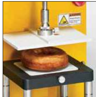
TA-CTP F Compression Top Plate for applying uniform compression forces on samples up to 4x6 inches (10x15cm) Fixture Base Table required.