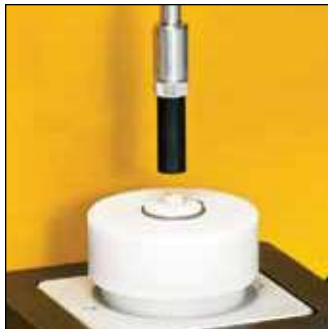
TA-DSJ F Dough Stickiness Fixture is standard test for measuring dough stickiness; important for processing raw dough. Fixture Base Table required.