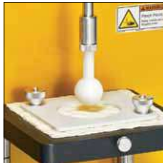
TA-DE F Dough Extensibility Fixture for holding sheet of raw dough or flat bread to measure breaking point of stretched sample. Fixture Base Table required.