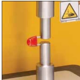
Table Coating Adhesion Fixture measures the adhesion force of a tablet coating to a tablet. Fixture Base Table required.