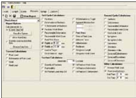
Sample Test Set-up