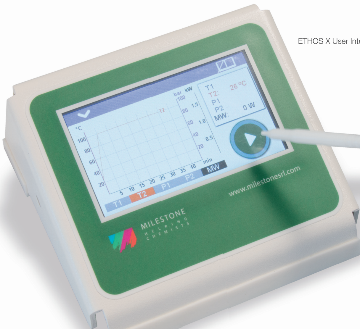
ETHOS X User Interface

USER INTERFACE - The ETHOS X is controlled via a compact terminal with an easy-to-read, bright, full-color, touchscreen display. The terminal is provided with multiple USB and Ethernet ports for interfacing the instrument to external devices and to the local laboratory network. The terminal runs a completely new user-friendly, icon-driven, multi-language software to provide easy control of the microwave run. Simply recall a previously stored method or create a new one, press 'START' and the system will automatically follow the user defined temperature utilising a sophisticated PID algorithm. Several applications, including all US EPA and ASTM methods available, are preloaded in the ETHOS X terminal. There is no need to input the number of samples or weights being extracted, as the software will automatically regulate the microwave power accordingly. This assures a consistent quality of extraction and simplifies the use of the instrument.